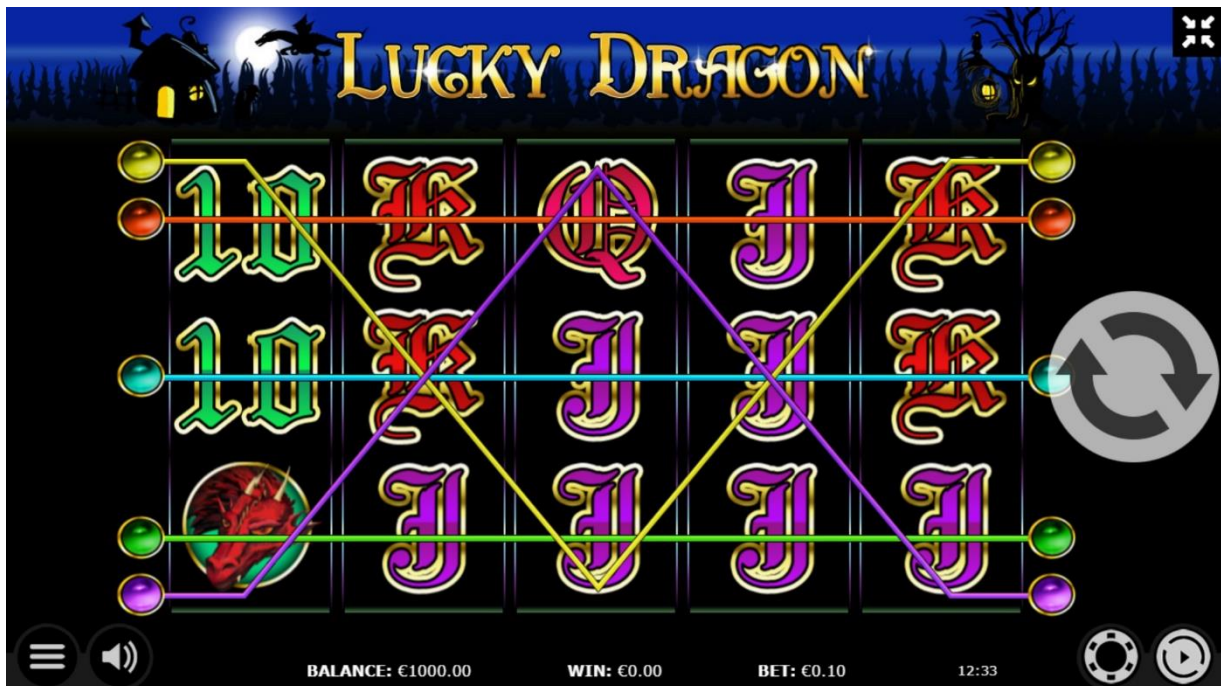
Figure 1: Screenshot of Lucky Dragon Go

The following image shows a screenshot of the game: