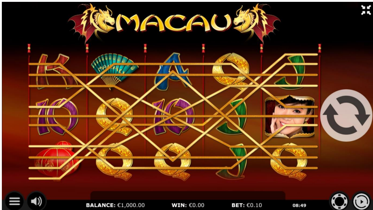
Figure 1: Screenshot of Macau

The following image shows a screenshot of the game: