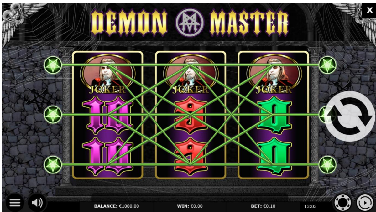
Figure 1: Screenshot of Demon Master Go

The following image shows a screenshot of the game: