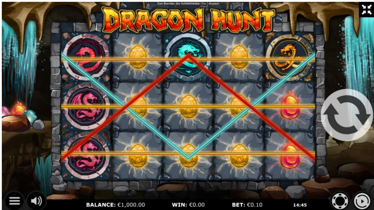
Figure 1: Screenshot of Dragon Hunt

The following image shows a screenshot of the game: