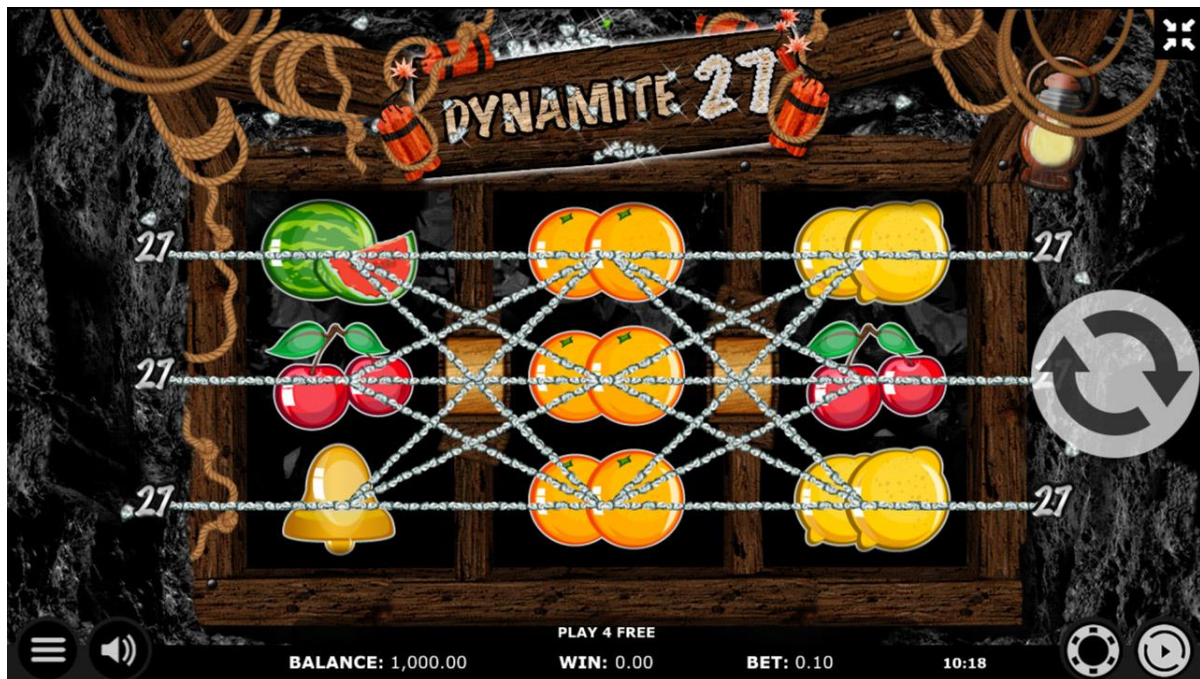
Figure 1: Screenshot of Dynamite 27 Go

The following image shows a screenshot of the game: