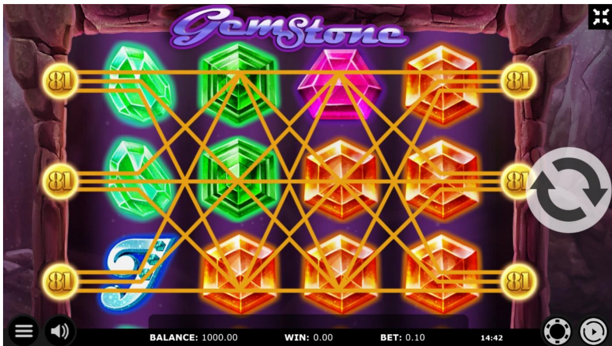
Figure 1: Screenshot of Gem Stone

The following image shows a screenshot of the game: