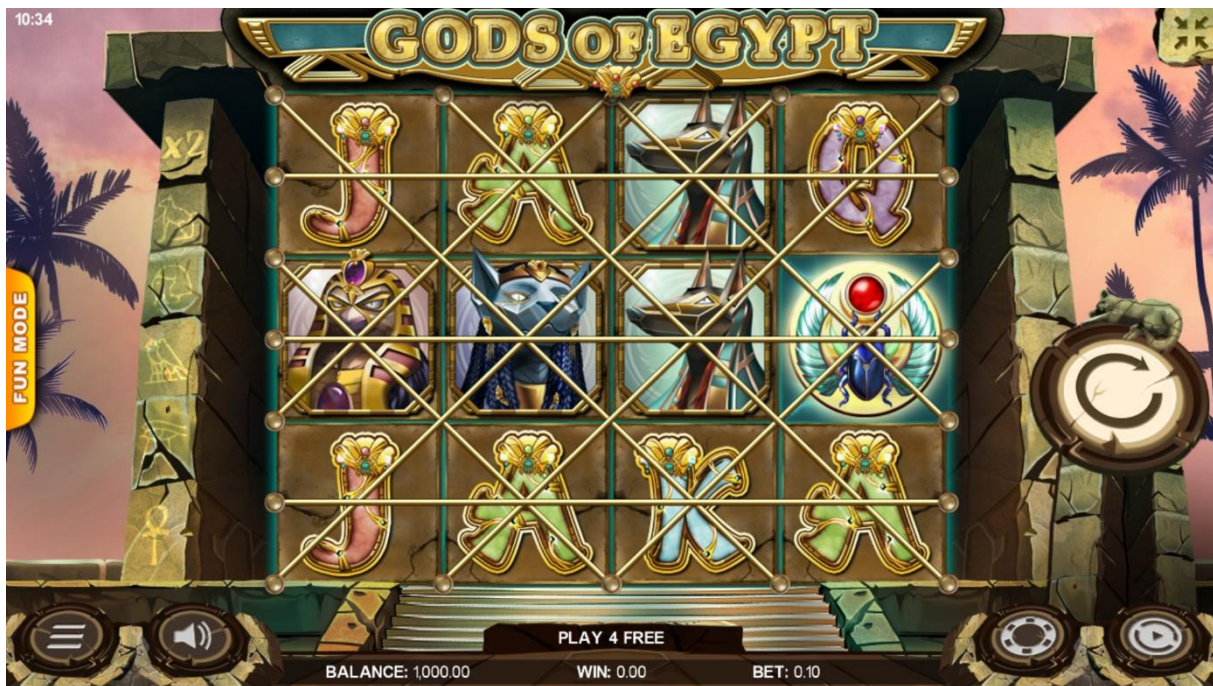
Figure 1: Screenshot of Gods of Egypt

The following image shows a screenshot of the game: