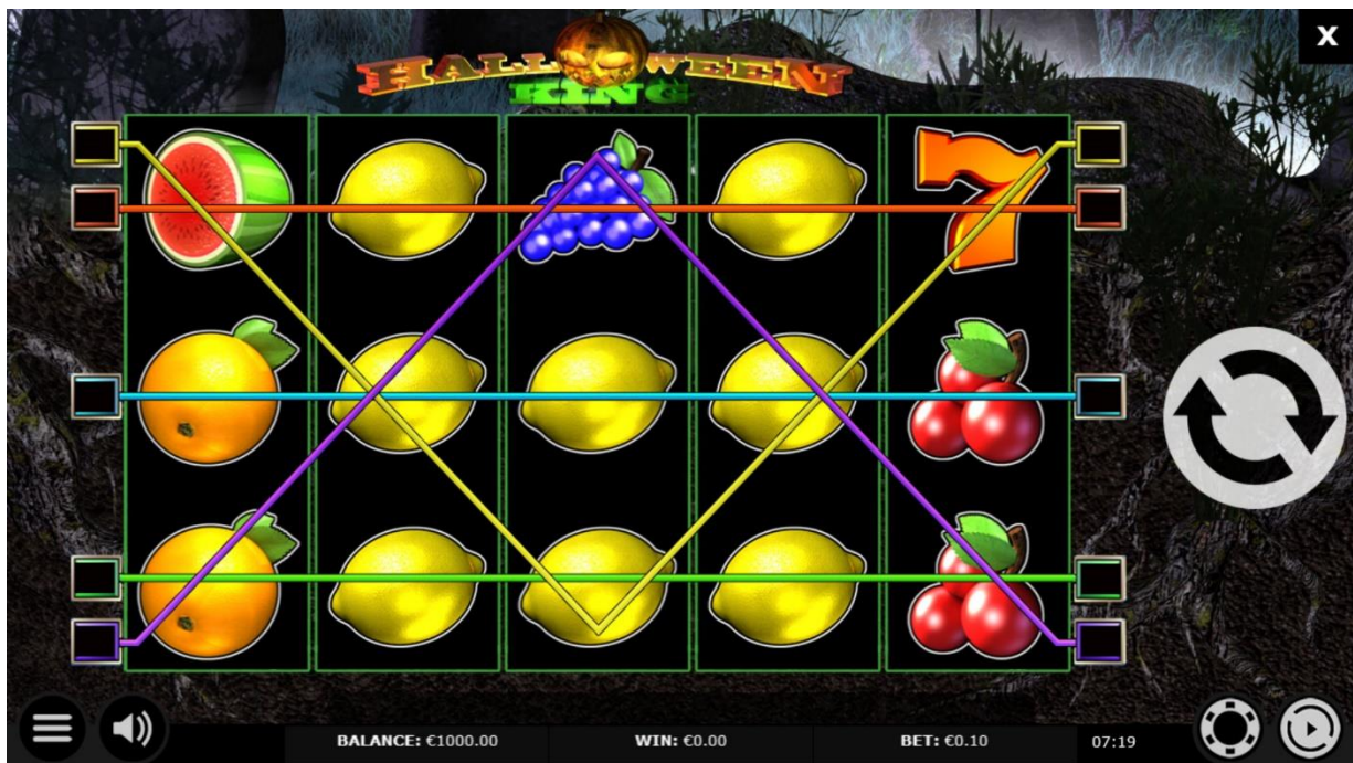
Figure 1: Screenshot of Halloween King Go

The following image shows a screenshot of the game: