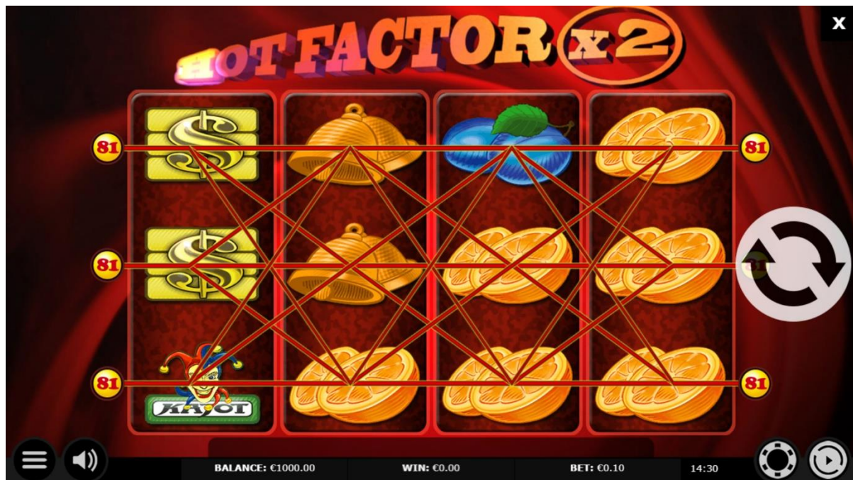
Figure 1: Screenshot of Hot Factor Go

The following image shows a screenshot of the game: