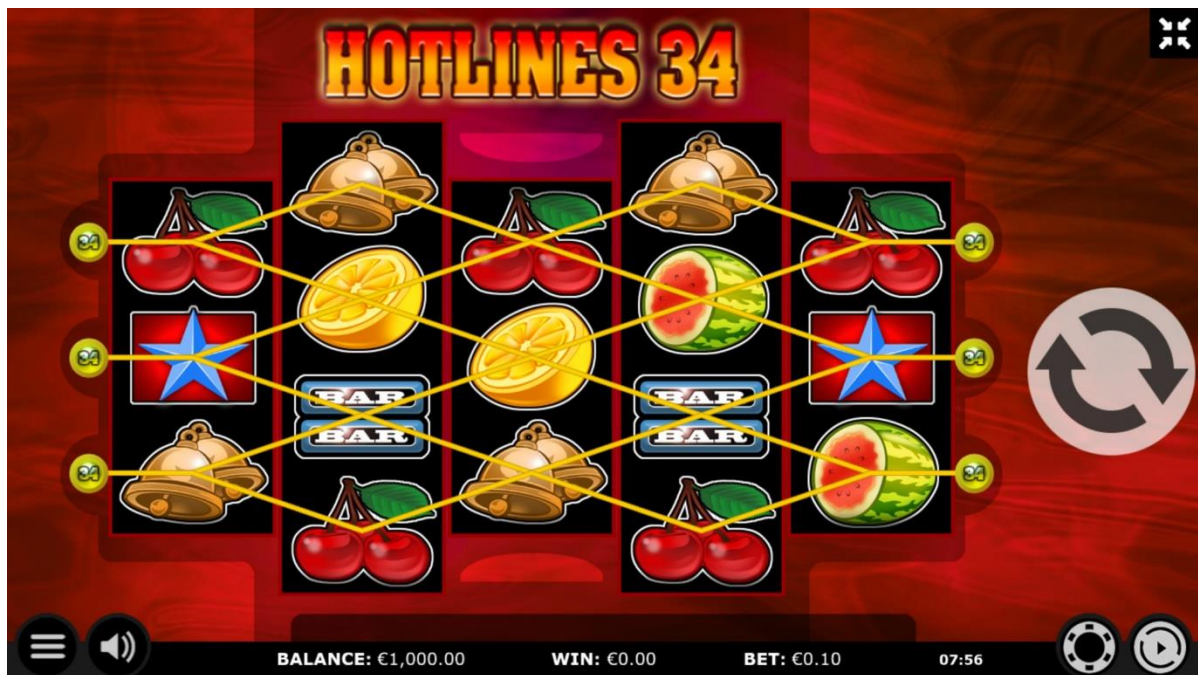
Figure 1: Screenshot of Hotlines 34 Go

The following image shows a screenshot of the game: