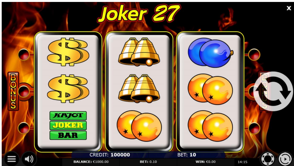
Figure 1: Screenshot of Joker 27 Go

The following image shows a screenshot of the game: