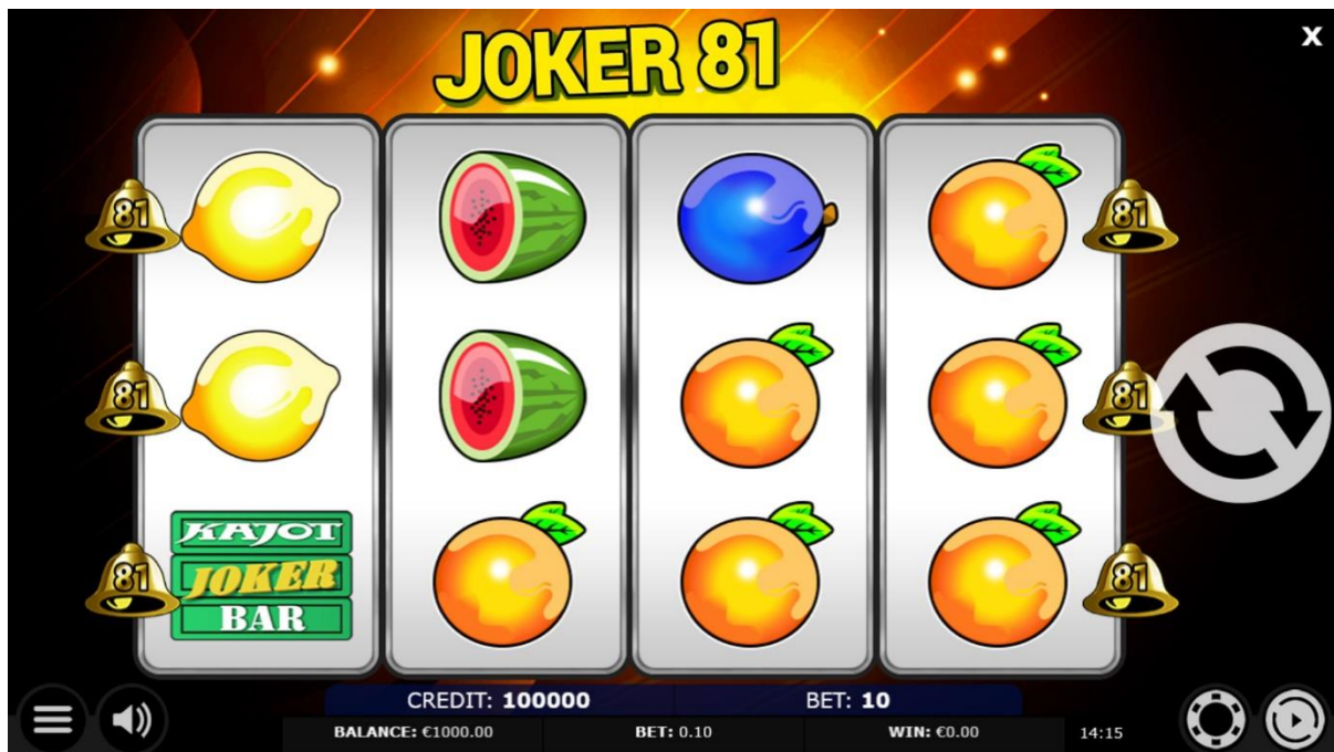
Figure 1: Screenshot of Joker 81 Go

The following image shows a screenshot of the game: