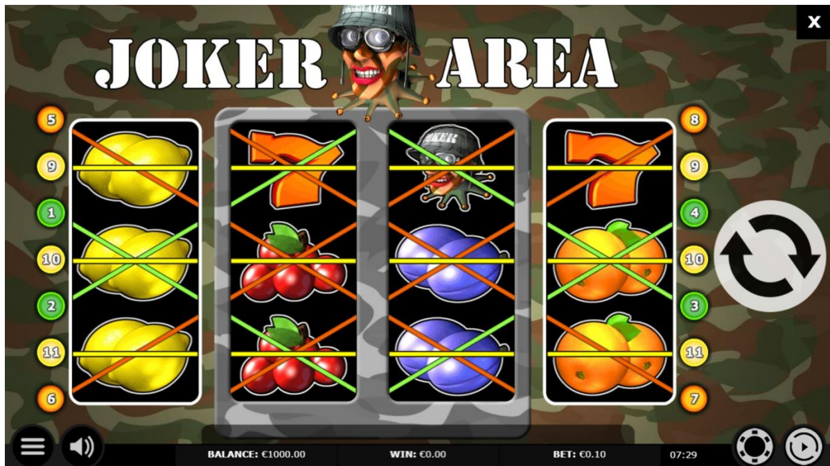
Figure 1: Screenshot of Joker Area Go

The following image shows a screenshot of the game: