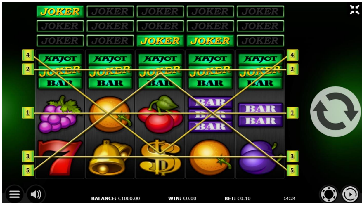
Figure 1: Screenshot of Joker Dream Go

The following image shows a screenshot of the game: