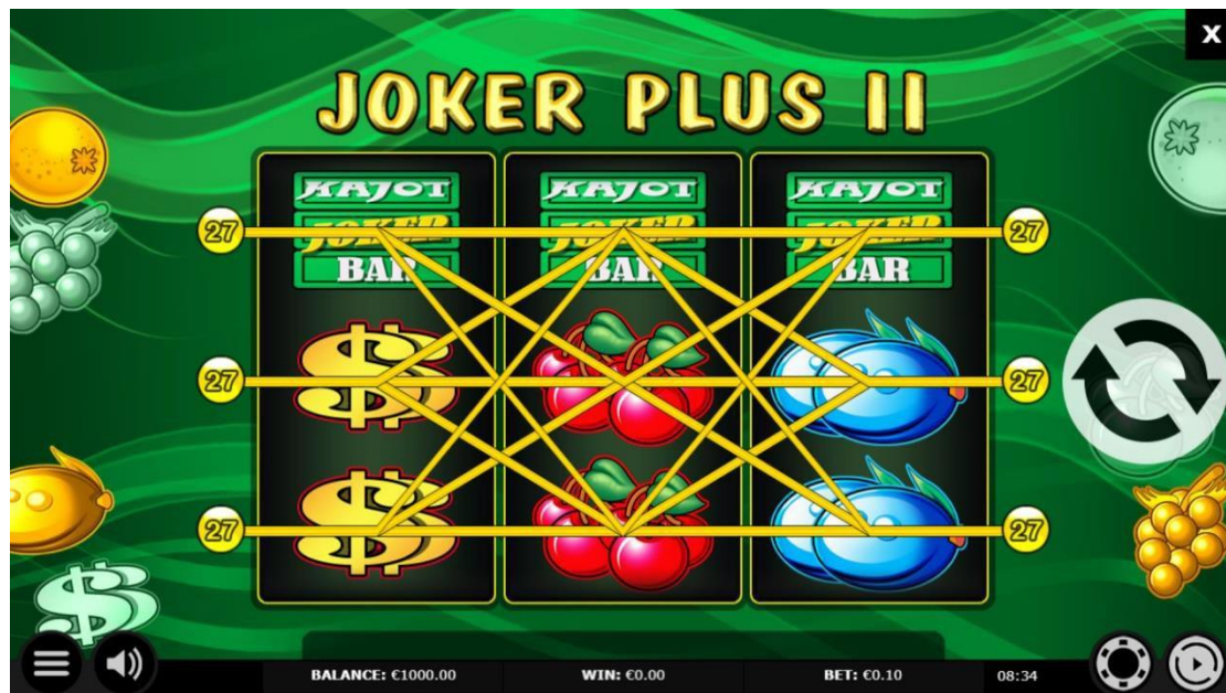
Figure 1: Screenshot of Joker Plus II Go

The following image shows a screenshot of the game: