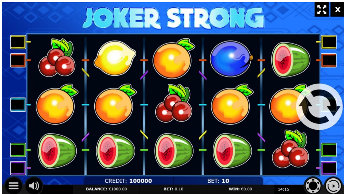
Figure 1: Screenshot of Joker Strong Go

The following image shows a screenshot of the game: