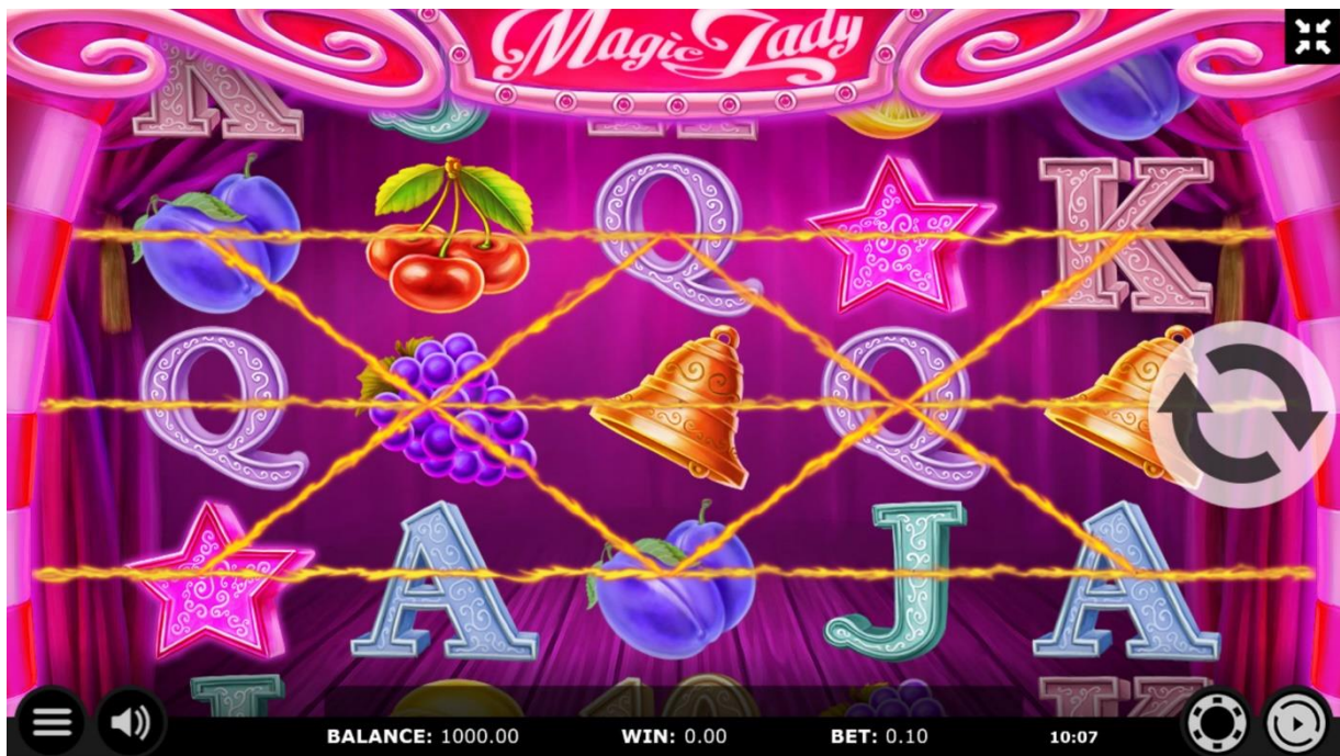
Figure 1: Screenshot of Magic Lady

The following image shows a screenshot of the game: