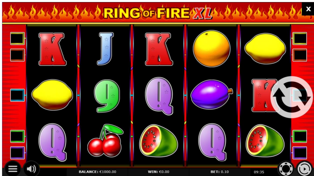
Figure 1: Screenshot of Ring of Fire Go

The following image shows a screenshot of the game: