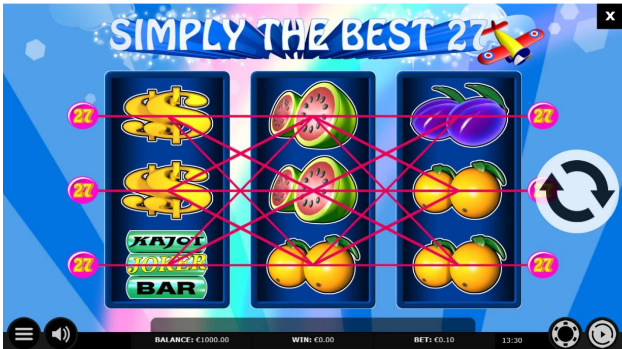
Figure 1: Screenshot of Simply the Best 27 Go

The following image shows a screenshot of the game: