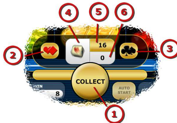
Figure 4: Screenshot of Gambling

The following image shows a screenshot of gambling: