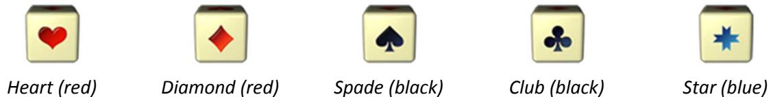
Figure 3: Symbols of Gambling

The following symbols are possible outcomes of the game: