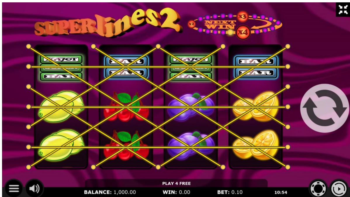
Figure 1: Screenshot of Super Lines 2 Go

The following image shows a screenshot of the game: