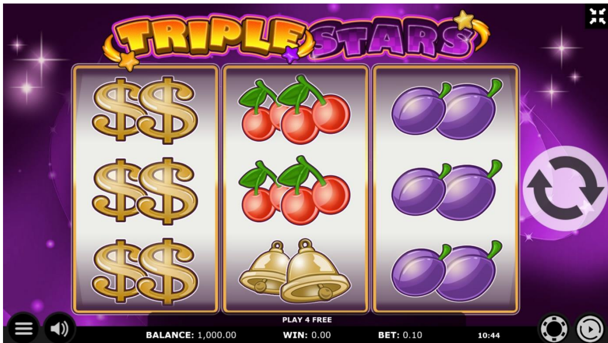
Figure 1: Screenshot of Triple Stars

The following image shows a screenshot of the game: