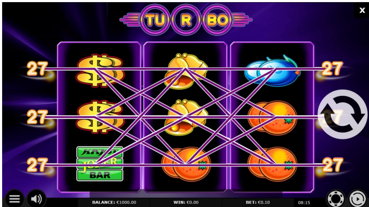
Figure 1: Screenshot of Turbo 27 Go

The following image shows a screenshot of the game: