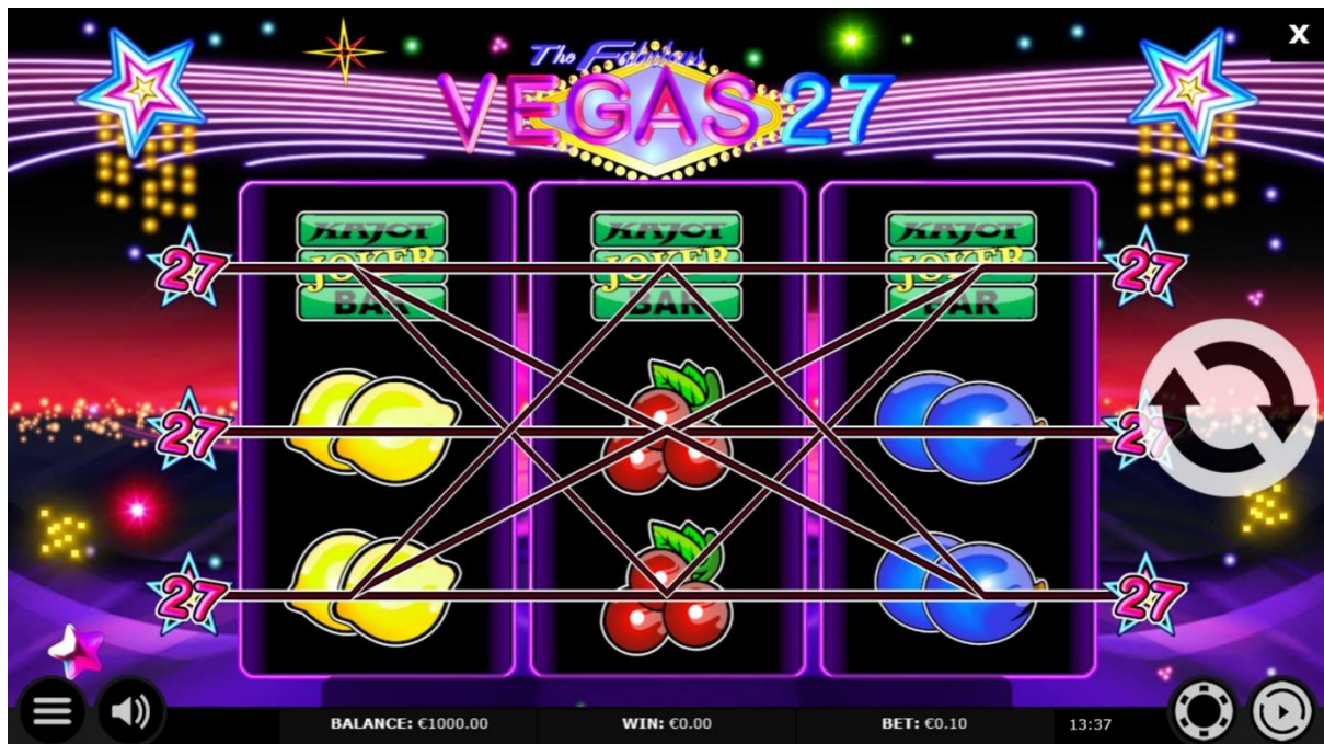
Figure 1: Screenshot of Vegas 27 Go

The following image shows a screenshot of the game: